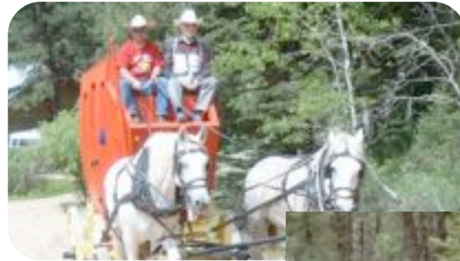
The Silver State Stage Lines. Free stagecoach rides.

That's just part of the excitement that awaits you during your week at Silver State. The ultimate adventure will be that of knowing who God is and knowing that He has a purpose for your life. Plan now to come and bring a friend with you!!!!